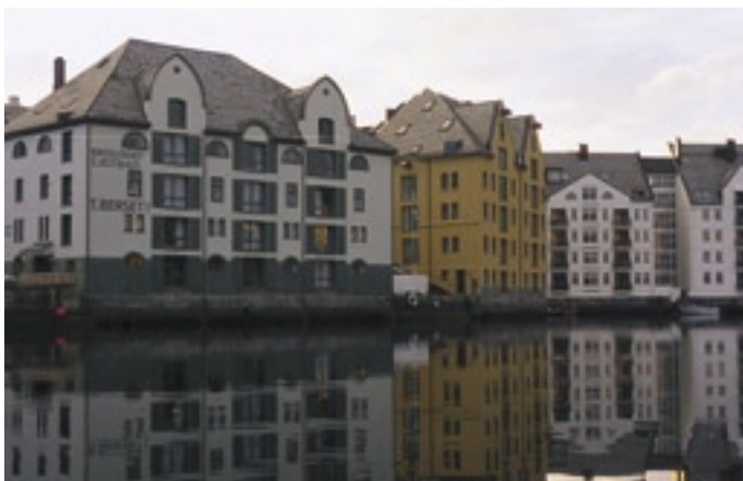
The Brosundet Canal in Ålesund