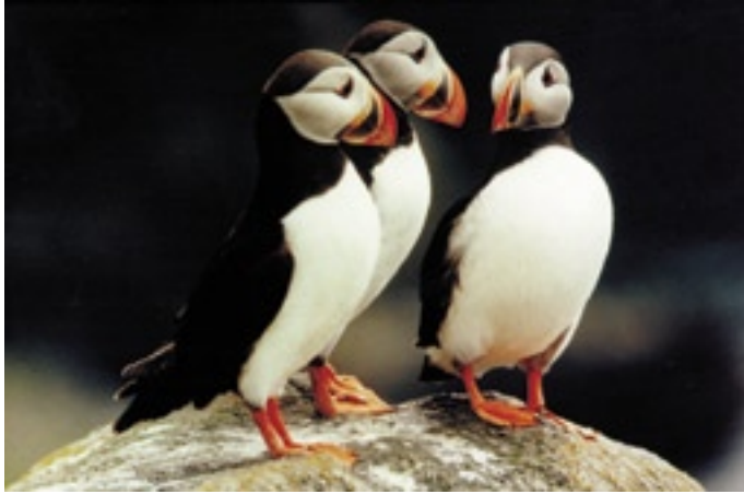
Puffins at Runde Bird Sanctuary